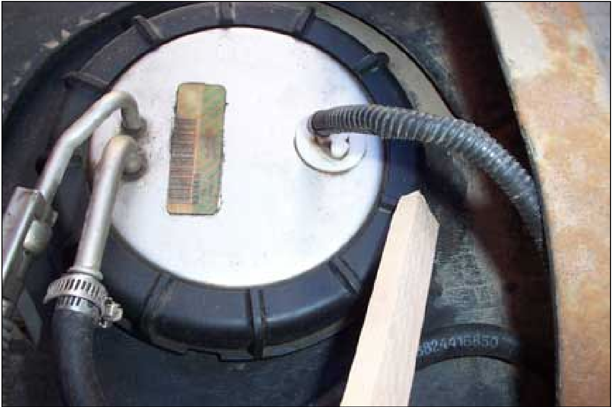
Figure 2 - Removing the lock ring