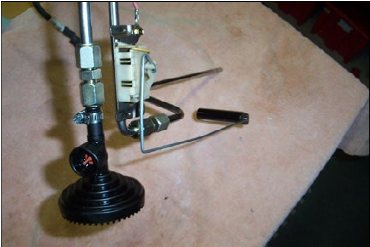
Figure 10 – Ready for installation