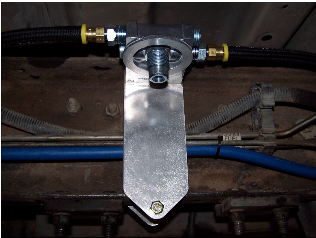
Figure 12 – Filter Bracket Mounted Inside Frame Rail