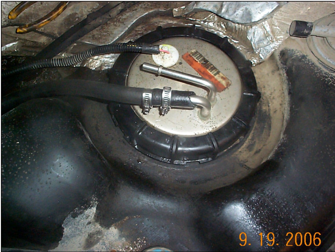
Figure 13 – New Fuel Line Double Clamped on Pickup Tube (Excursion Shown)