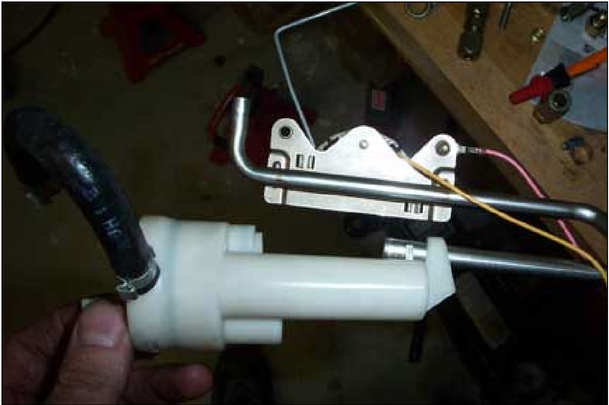
Figure 5 - Removing the mixing valve