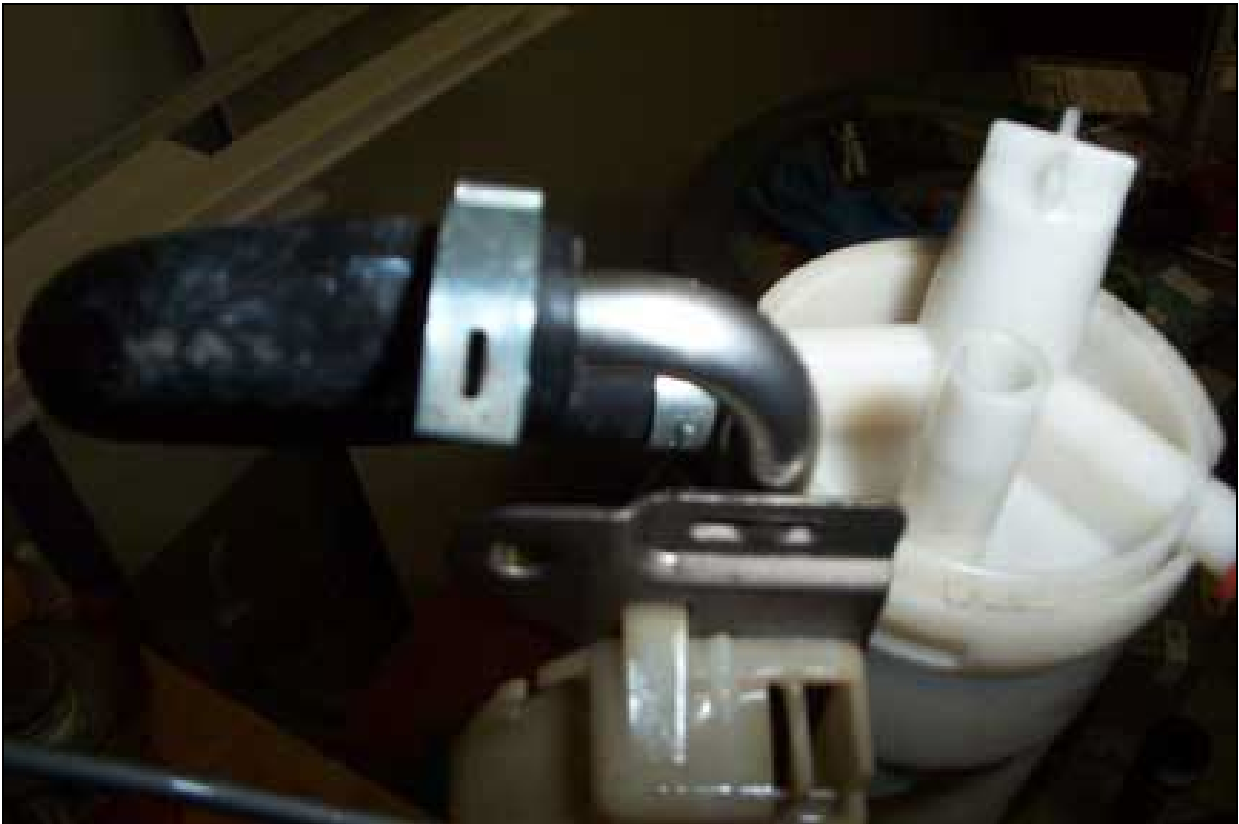
Figure 4 - Cutting the hose clamp